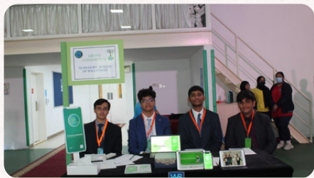
Team- Wolves of Wall Street