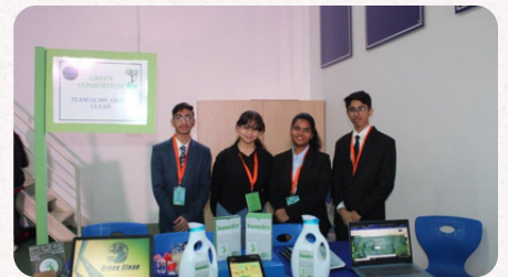
Team- Green Clean