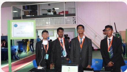
Team - Greeniors