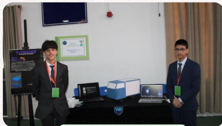
Team- EV Truck