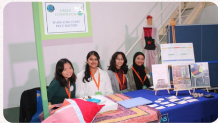
Team- Every Piece Matters