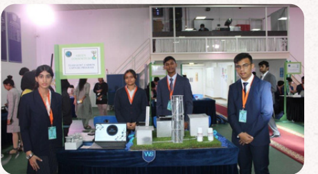
Team- Carbon Capture Program