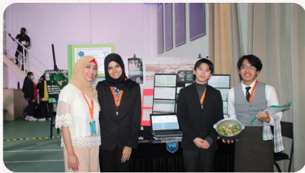
Team- The Beet Drop