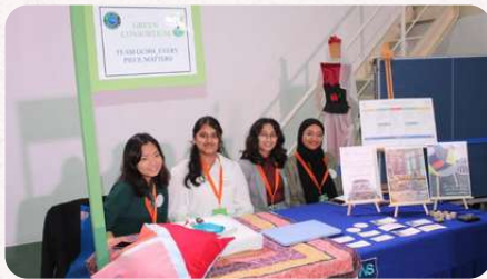
Team- Every Piece Matters