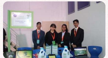
Team- Green Clean