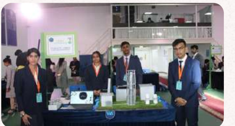
Team- Carbon Capture Program