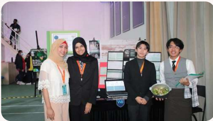
Team- The Beet Drop