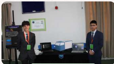
Team- EV Truck