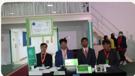
Team- Wolves of Wall Street