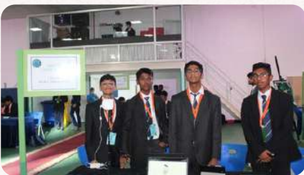
Team - Greeniors